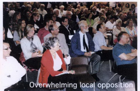
Overwhelming local opposition