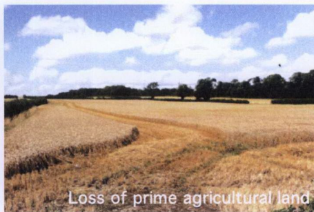
Loss of prime agricultural land