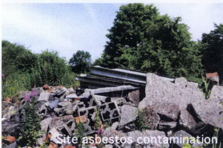
Site asbestos contamination