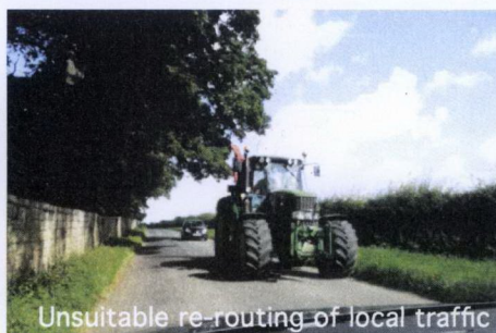
Unsuitable re-routing of local traffic