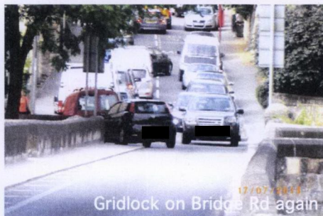
Gridlock on Bridge Rd again